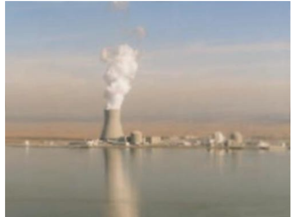
Salem Generating Station

The resulting chemical modeling clarified the small role of such discharges to the ecology and chemistry of the river, and illustrated how the chemical could be used safely in this industrial application.